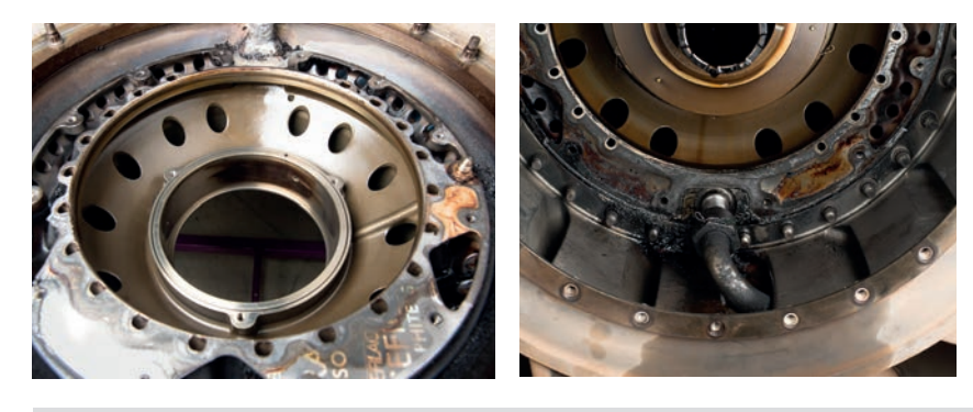
LESS TIME SPENT CLEANING. With ASTO 560 (left), the No. 5 bearing housing in a CFM56-7 engine is much cleaner than the same component after a similar operating time with a competitor's oil. The engine had over 23,500 flight hours with ASTO 560 since its last overhaul and 52,200 flight hours total life.